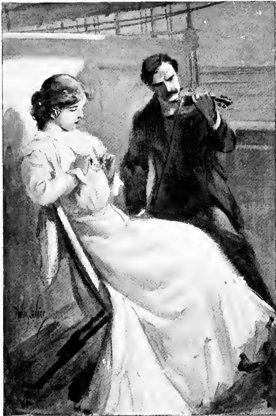
“He grabbed up his wooden box and made a miracle”